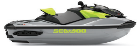
● Ice Metal and Manta Green